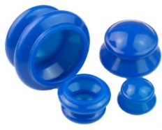
Moving Silicon Cups