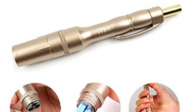
Hijama Pen (Lancet)